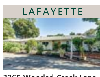
3265 Wooded Creek Lane Single level 4 bed/ 2 bath home on .36 acre flat lot within walking distance to Springhill Elementary & Acalanes High. $1,195,000