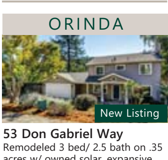
53 Don Gabriel Way Remodeled 3 bed/ 2.5 bath on .35 acres w/ owned solar, expansive lawn, vegetable garden & chicken coop. $1,595,000